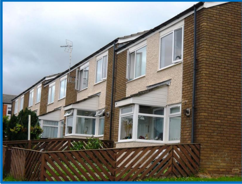
Pre works and Completion of EWI works in Peulwys estate.