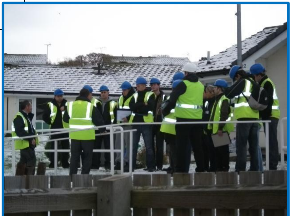
Plumbing and heating students of Llandrillo College attended a green initiatives master class, on site, with framework contractor PH Jones