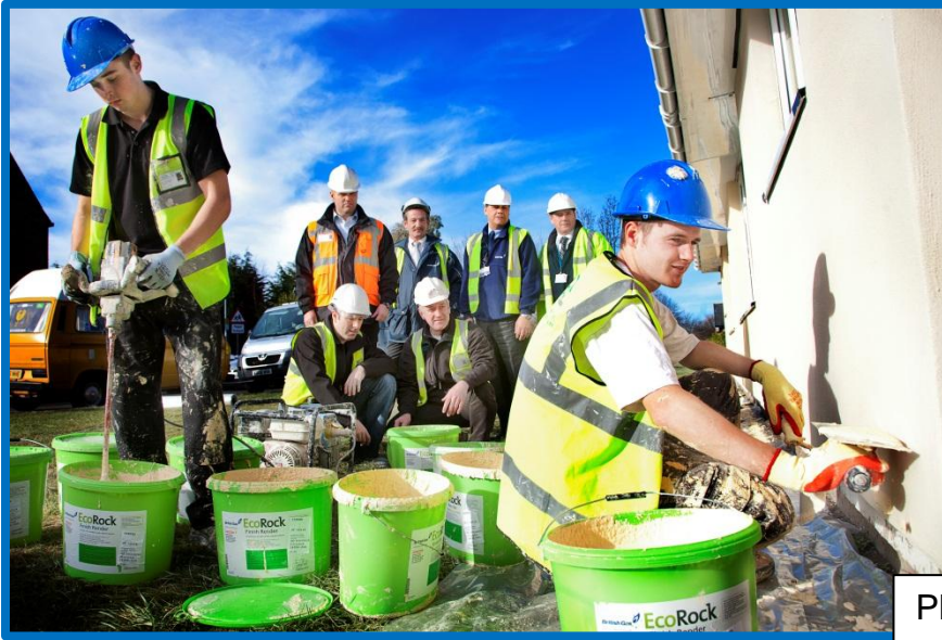
Plastering students of Llandrillo College gain work experience after innovative training of modern method External Wall Insulation technique