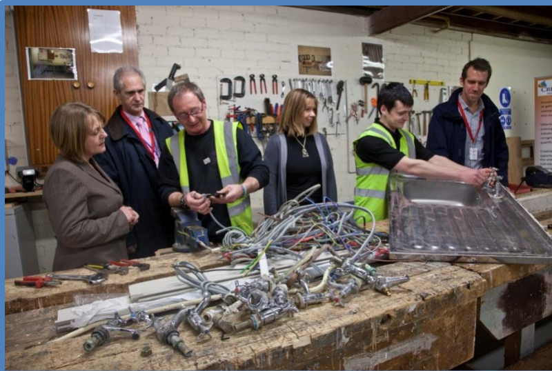
Crest Cooperative Recycling initiative in progress